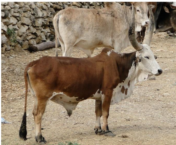
“Zebu in Wukro, Ethiopia,”