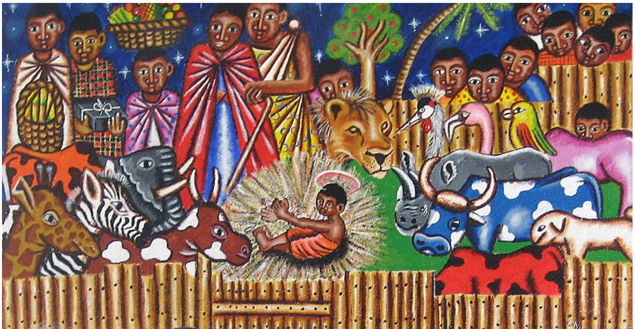
Nativity by an unidentified Kenyan artist, perhaps early 21 st century.